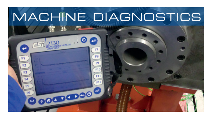
To recognize first signs early to safeguard your productivity!

After individual consultation and at defined intervals, we carry out inspections, oil changes and the replacement of bearings and seals or other wear parts on your drive solution for you. We are also happy to handle inspection work for drives from other manufacturers.